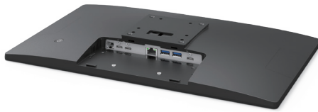
Integrate devices via USB-C