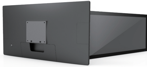
Supports 75x75 VESA mounting