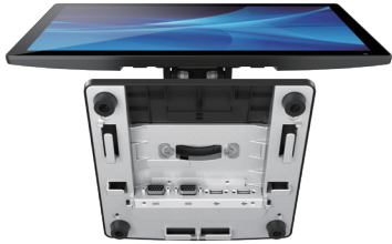
Extension IO integrated via stand