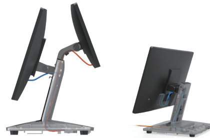
Single hinge stand + Dual display